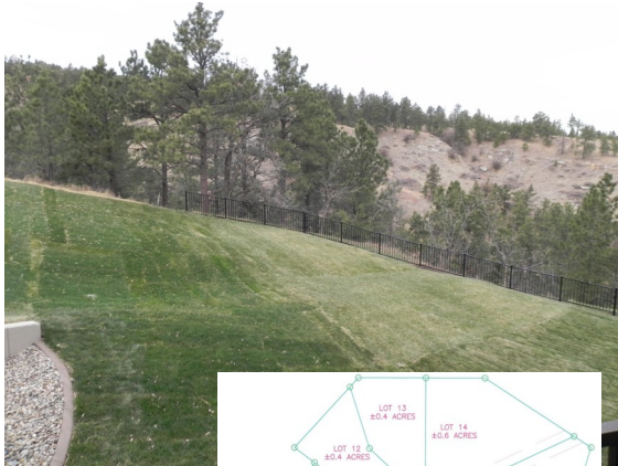
View from covered back deck.

These two bedroom, two bathroom, ranch style townhomes located at Tower Road Court in the Skyline Pines East Subdivision. This townhome has an award winning design, nestled in the beautiful Black Hills, overlooking Rapid City. Many home owner choices available, including your own personal design!